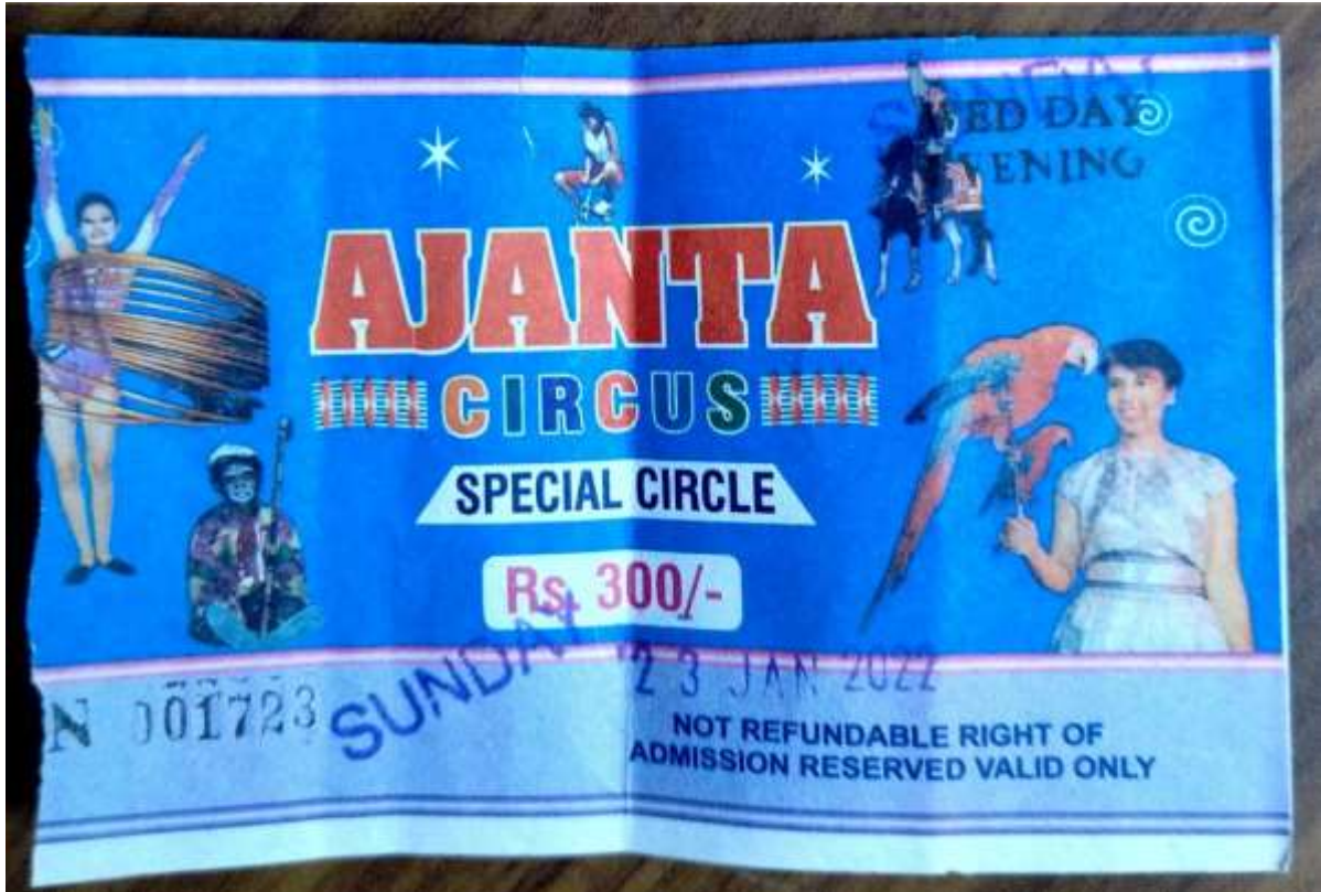
Photo 23: A ticket from the 4 pm show attended by the eyewitness investigator