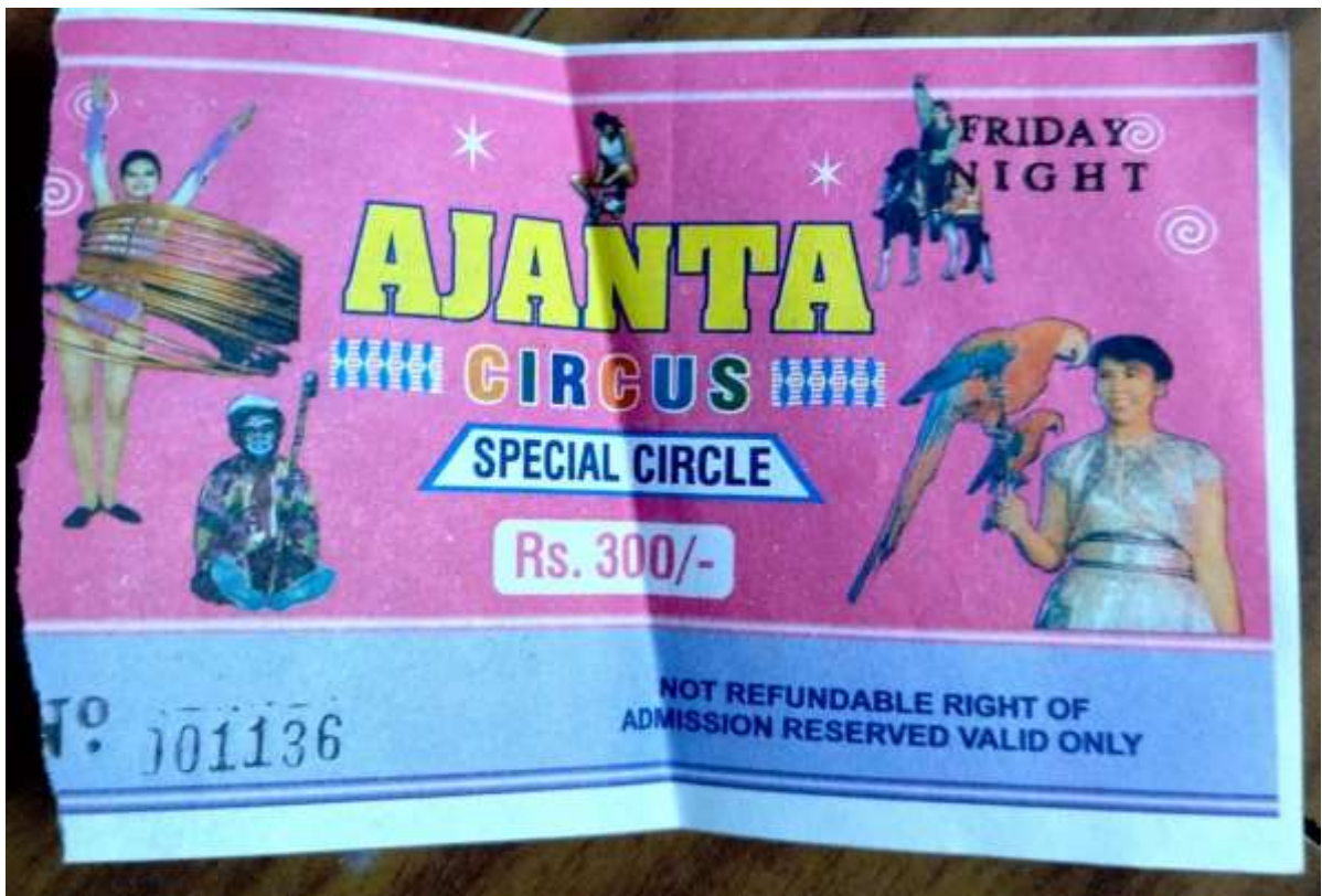
Photo 24: A ticket from the 7 pm show attended by the eyewitness investigator

Copies of photographs and videos from the eyewitness investigation are on the pen drive enclosed as Annexure 3.