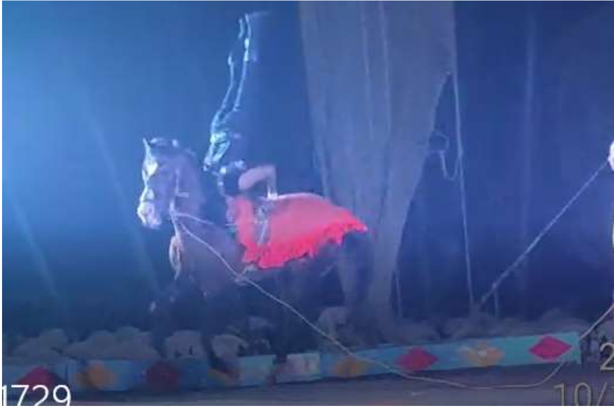
Photo 14: A male performer does a headstand on top of a horse while the horse is being made to run in the ring, an act not registered with the AWBI.