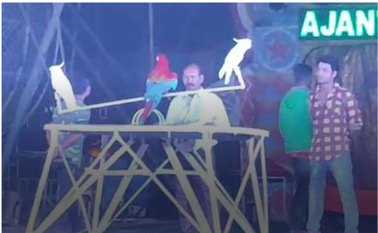
Photo 20: Two cockatoos are made to balance on a seesaw while a macaw moves side to side on it, an act not registered with the AWBI.