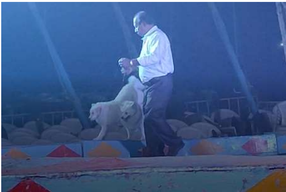
Photo 8: Dogs are made to jump zig-zag across each other, an act not registered with the AWBI.