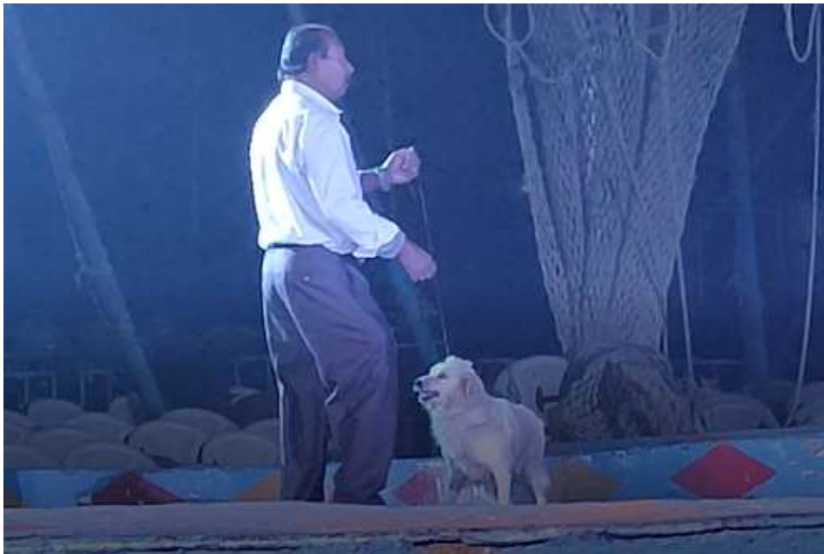
Photo 3: An exhausted dog stops mid-act while being pulled up using a rope tied to his neck.