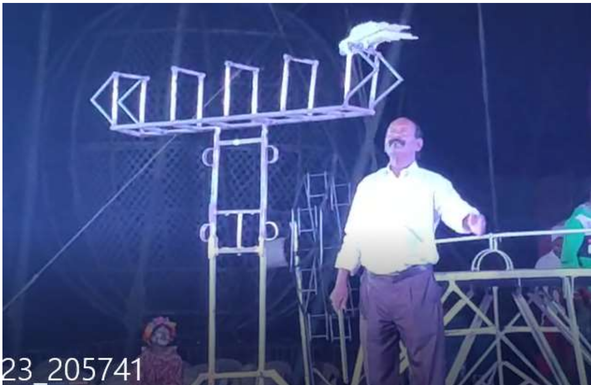
Photo 18: A cockatoo is made to jump on bars on a prop, an act not registered with the AWBI.