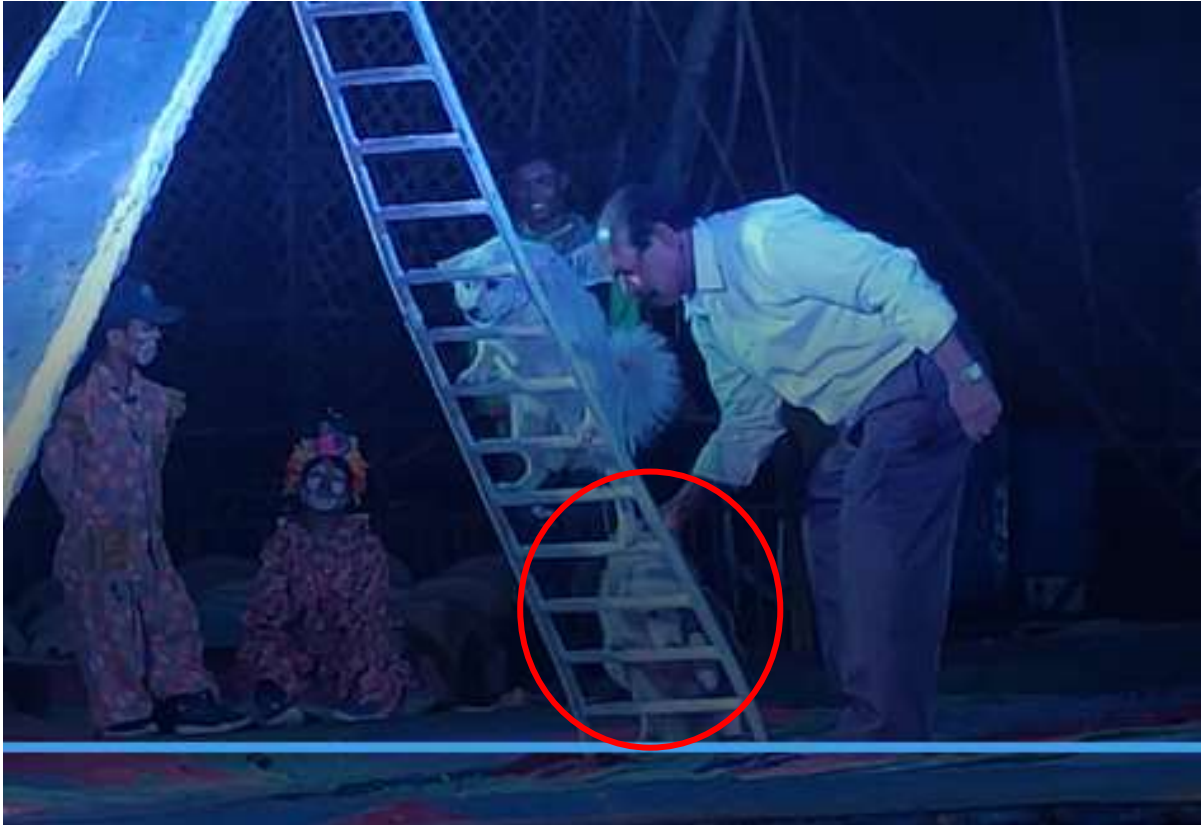
Photo 10: A human performer forces a visibly reluctant dog to climb up a slide.