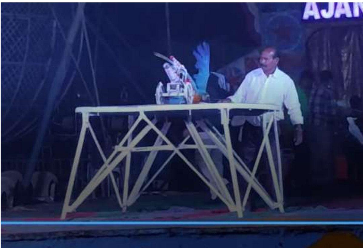
Photo 22: A macaw is made to fire a cannon, an act not registered with the AWBI.