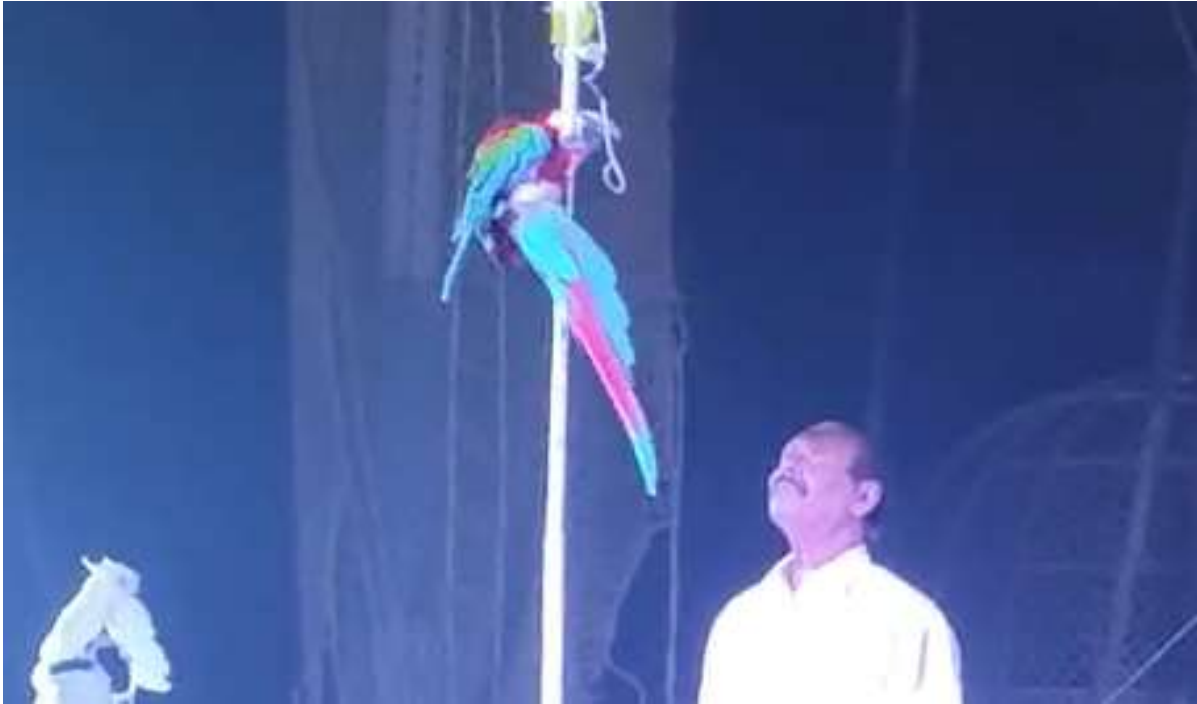
Photo 17: A macaw is made to hoist a flag, an act not registered with the AWBI.