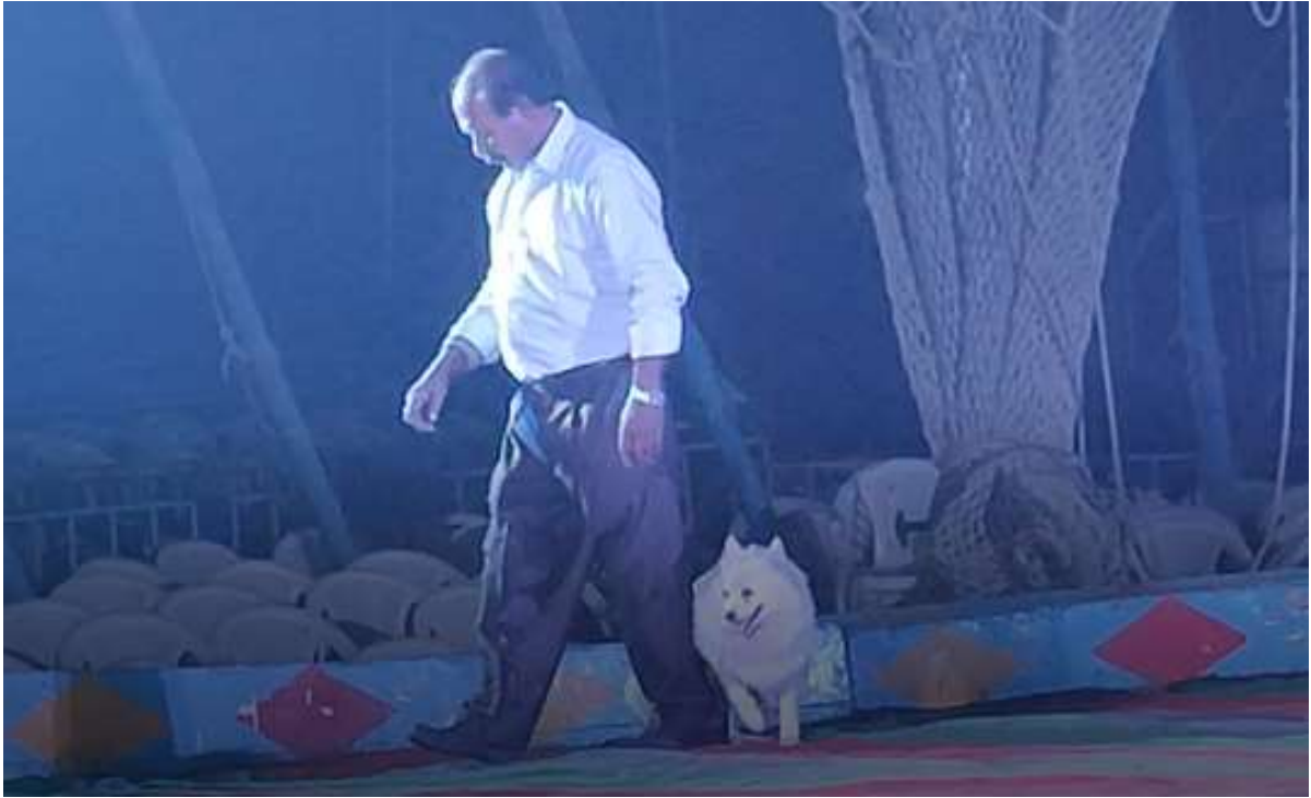
Photo 6: A dog walks crisscross between a man's legs, an act not registered with the AWBI.