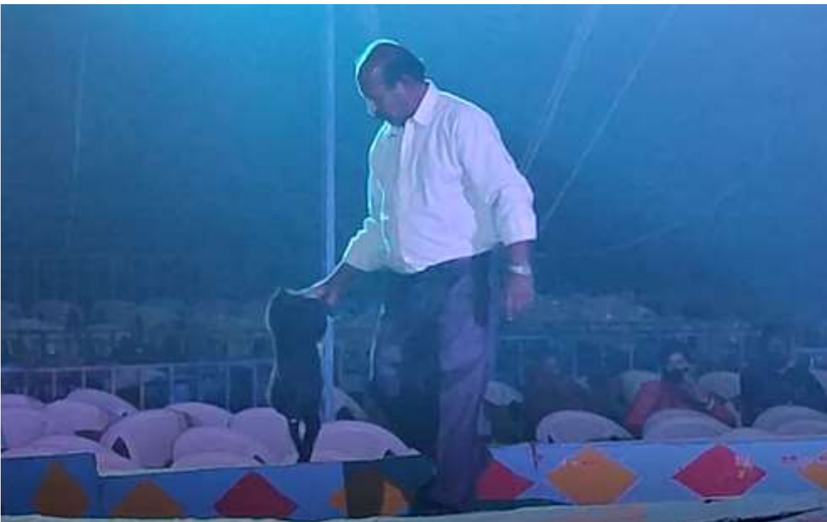
Photo 7: A dog is forced to walk on his forelegs on the edge of the ring as a human performer holds his hind legs in the air, an act not registered with the AWBI.