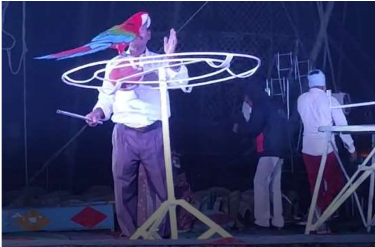
Photo 19: A macaw is made to walk backwards on a basketball, an act not registered with the AWBI.