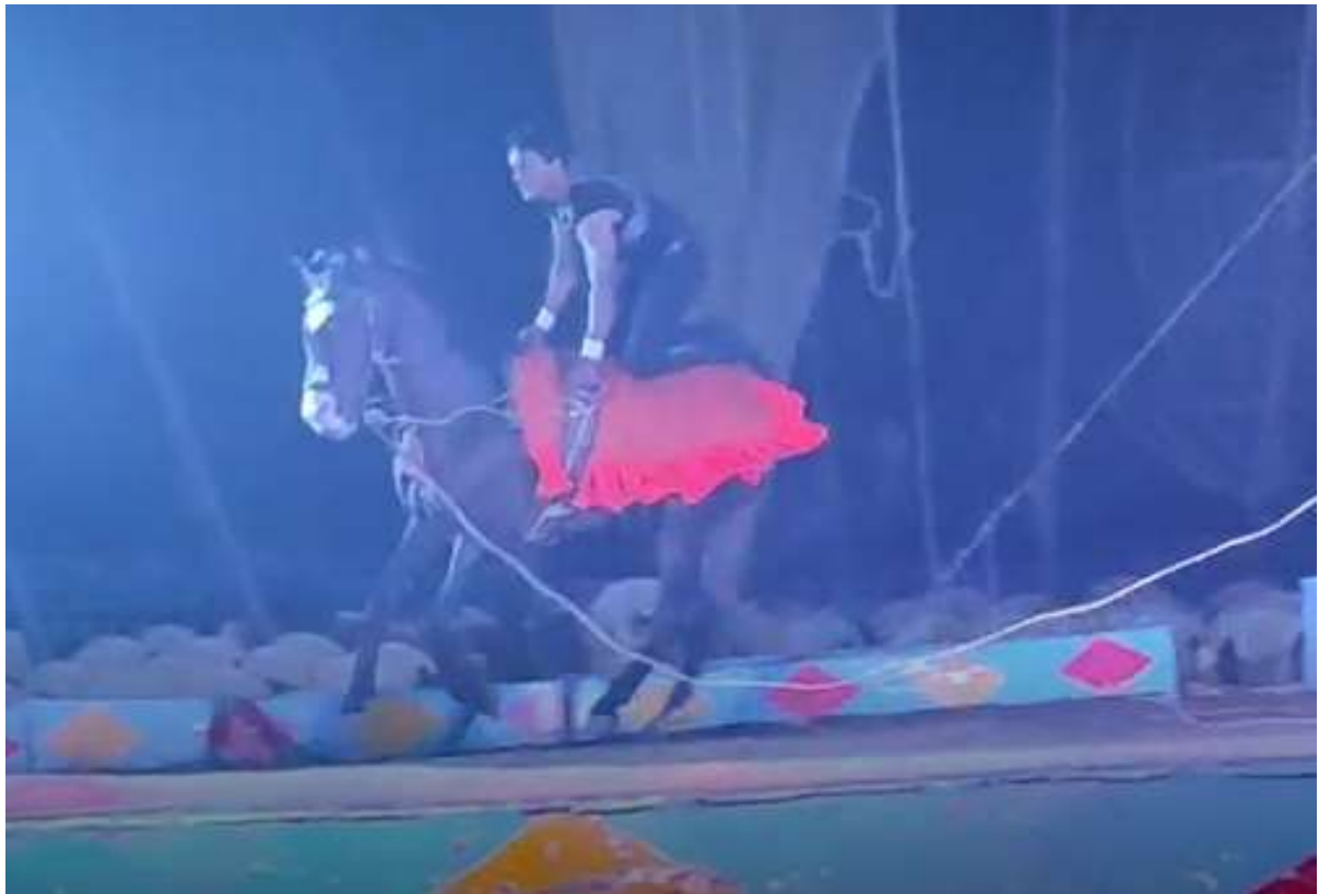
Photo 13: A male performer kneels on top of a horse's back while the horse is forced to run around the ring in circles, an act not registered with the AWBI.