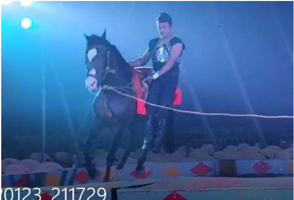
Photo 12: A male performer jumps on and off a horse's back, an act not registered with the AWBI.