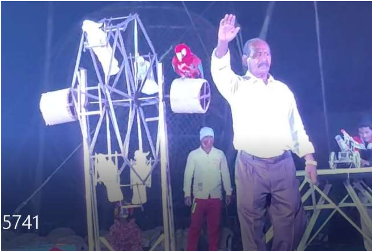
Photo 21: Four cockatoos are made to balance on a miniature giant wheel while a macaw walks on a cylindrical attachment, an act not fully registered with the AWBI.