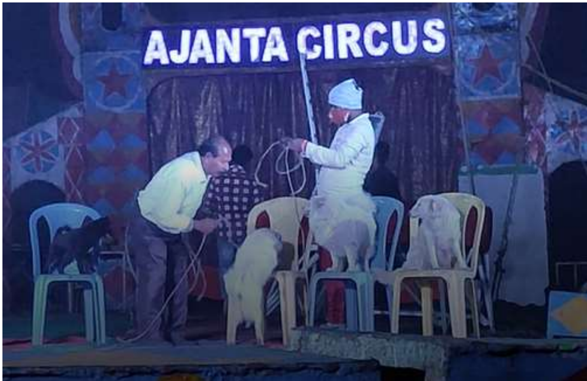
Photo 1: Dogs are made to sit on plastic stools, an act not registered with the AWBI.