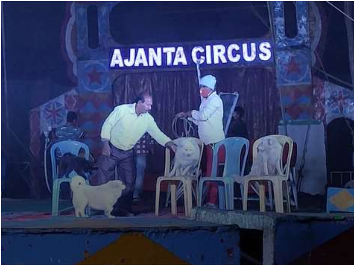
Photo 2: A dog is pushed from one chair to another by a human performer.