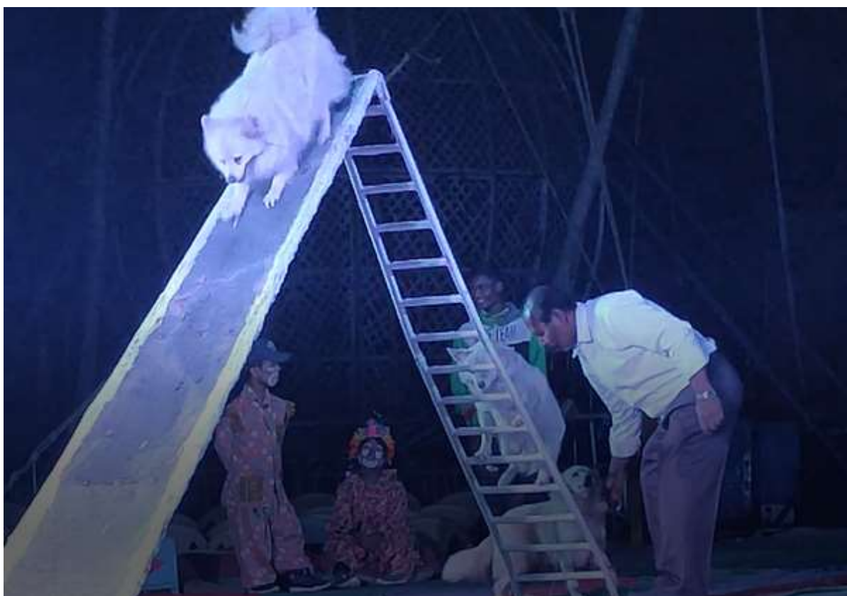
Photo 9: Dogs are forced to climb up and slide down a slide, an act not registered with the AWBI.