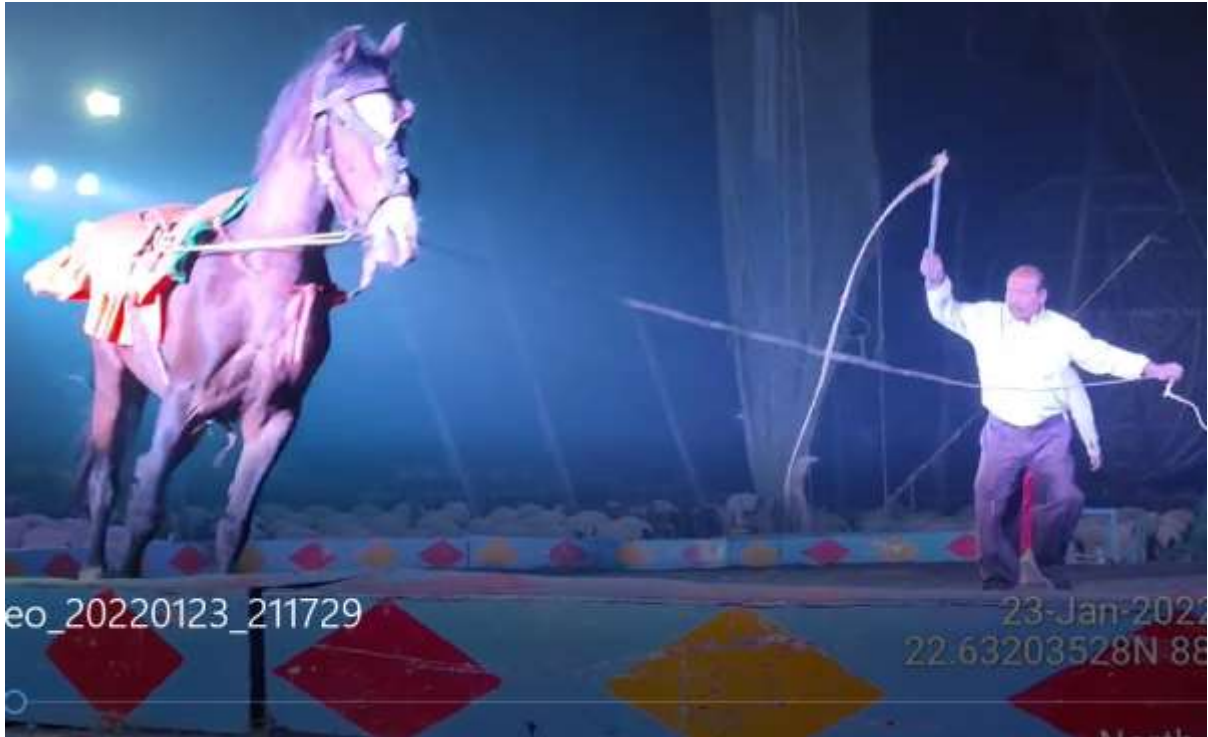
Photo 11: A horse runs in the ring as a human performer wields a whip to scare the animal, an act not registered with the AWBI.