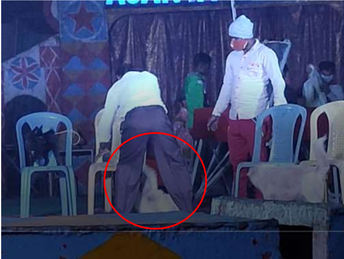
Photo 4: A human performer moves a chair with force, causing the dog who was sitting on it to fall down.