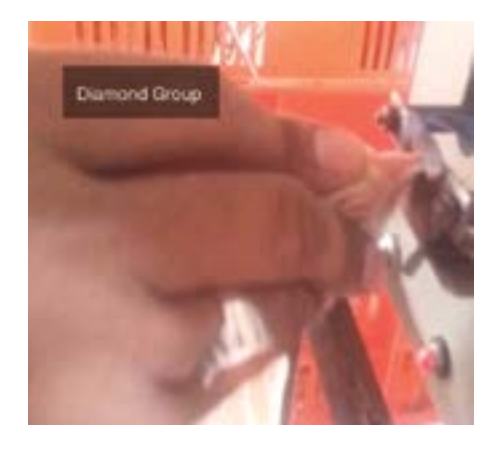
Parts of chicks' sensitive beaks are cut off without any painkillers.

Sometimes chicks used for other purposes are debeaked, too. Eight or nine days after chicks who'll be used to breed more chickens for the meat industry are born, Diamond Group uses a machine to cut off their beaks. A supposedly trained worker sits in front of the machine,