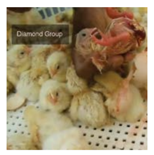
Problems with the incubator can mean that some chicks are born with organ deformities.

Large-scale commercial incubators are controlled by company officers and have automatic back-up systems. However, problems can still occur, including causing chicks to be born with organ deformities and other health problems.