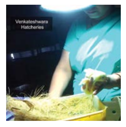
Many chicks undergo a distressing sexdetermination procedure.

usually press hard on their sensitive genitals in order to determine their sex. Hatcheries that supply the egg industry carry out sexing because only females can lay eggs. Males are therefore considered useless and unprofitable and are typically killed in horrific ways, as outlined below.