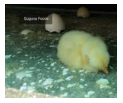
Chicks born in the meat and egg industries experience misery from the moment they hatch.

Suguna conducts its business using the integration model, or contract farming, which means it hatches chicks and gives them to independent farmers to raise. When the chickens reach an ideal weight for slaughter, the company buys them back to kill them and sell their