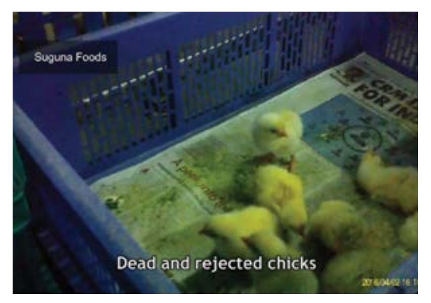
Chicks like these, who are sick or otherwise unwanted, are disposed of like garbage.

include early or late hatching, lameness, organ deformities, and general weakness. Once rejected, living, dead, and still-hatching chicks are all thrown into the same crates. Those who are still alive sometimes, in desperation, begin to eat other chicks' carcasses.